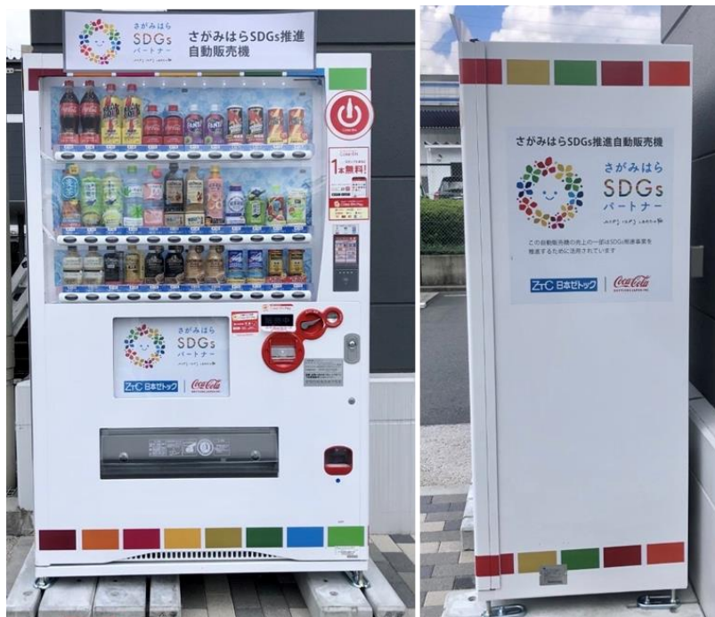
“Sagamihara SDGs Promotional Vending Machine” installed in Sagamihara City