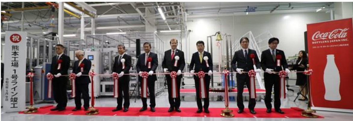
Operation commencement ceremony: Tape cut

Venue : Kumamoto Plant (Minami Takae, Minami-ku, Kumamoto), CCBJI